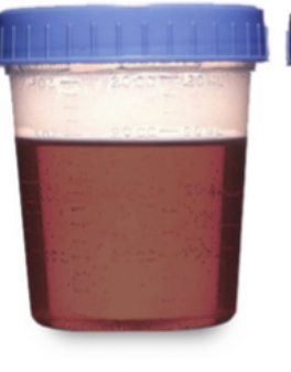
DARK ORANGE AND SEMI-CLEAR. NOT OK