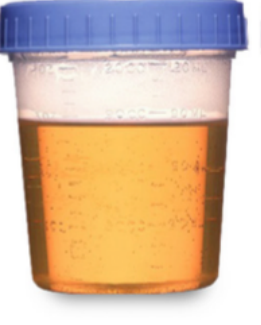
LIGHT ORANGE AND MOSTLY CLEAR. ALMOST THERE!