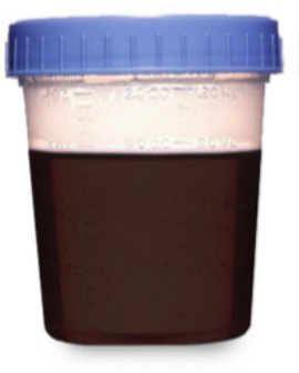
DARK AND MURKY. NOT OK